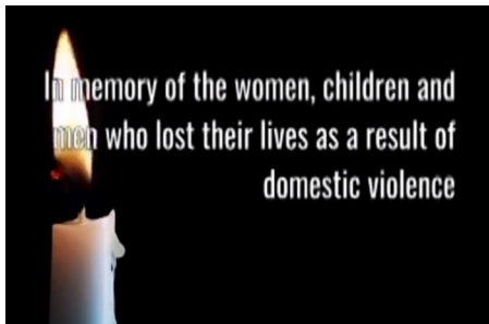
Annual Candlelight Vigil